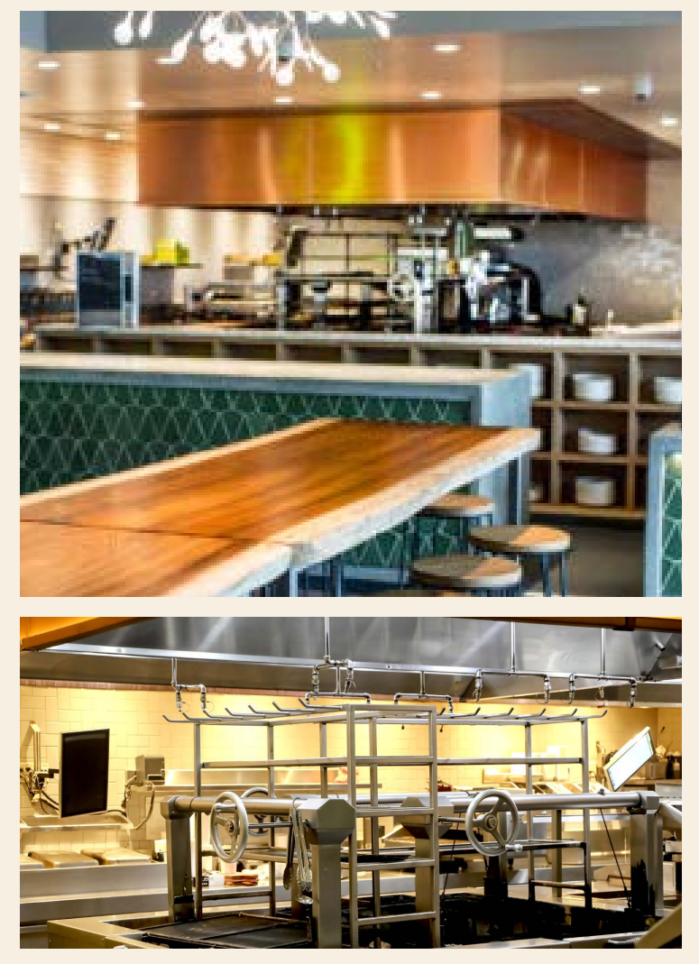
ABOVE: Heirloom—a Jorgensen install in Fresno, California.

Installation, service, and repair of: portable fire extinguishers, fire sprinklers, fire alarm, fire pump, backflow preventer, gas detection, restaurant and kitchen suppression systems, CO2 and clean agent fire suppression systems, safety supplies, and safety training.